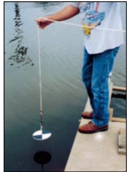
Figure 2. Plankton blooms should be abundant enough that a Secchi disk can be faintly seen at a depth of 10 inches.

The decision to feed baitfish supplemental or complete feeds must include a consideration of the quality and quantity of natural food available both seasonally and among ponds. The composition and abundance of plankton in the pond affects the fish's dependence on prepared feeds. In ponds that do not develop or maintain good plankton blooms during the production season, natural foods may not provide sufficient nourishment for the fish, making nutritionally complete feeds preferable to supplemental feeds. Supplemental or complete feeds may be used in a mixed feeding strategy according to the availability of natural food in the pond. However, this requires the skill to quickly and accurately assess the quality and quantity of natural foods available in the pond and to select the appropriate feed for the conditions of the pond.