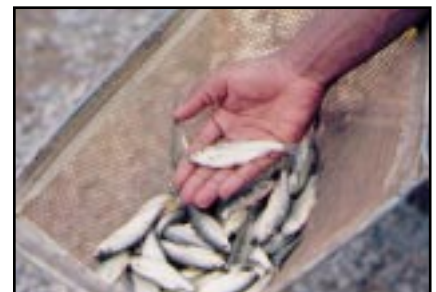
Figure 1. Golden shiners derive nourishment from natural foods as well as prepared foods.

Only recently have some of the nutritional requirements of the different baitfish species been established. Baitfish feeds in the past have been similar in composition to catfish feeds, and may not have supplied the necessary nutrients or may have supplied nutrients already provided by natural foods.